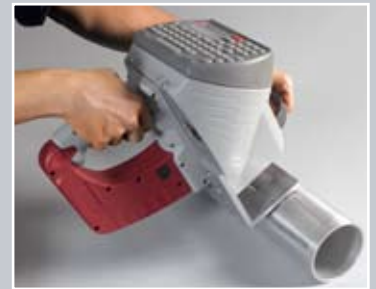
Mobile use on-site