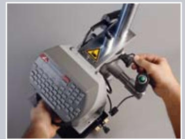
Quick mounting on the column frame