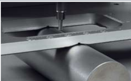
Standard work angle with the prism

The hand-held and compact designed CNC marking systems FlyMarker® Mobil, Station and Combi are featured by their easy handling. They can be used without any knowledge of a programmer: