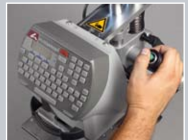
Fix the component and initiate the marking. Done!

to mark on the base plate, set the required pin distance and initiate the marking in just one movement. Because of a special lamination on the bottom side of the foot the component is fixed and can't get out of place. A progressive and good quality mark is assured.