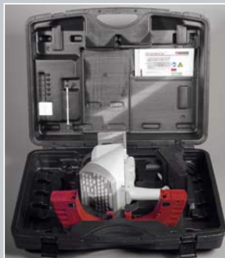
Hard protective case

Those who need to code a lot of information on small space are able to mark a Data Matrix® code. You can either type in the letters on a keyboard or transfer them by a serial port RS 232.