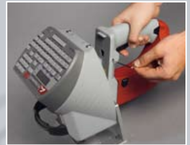
Easy release of the handgrip